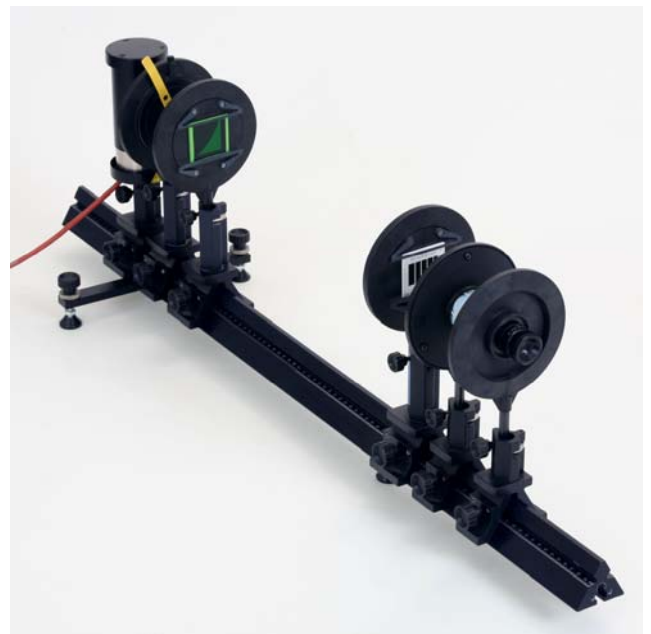
Illustration 2: Experiment setup

The condition for a coherent illumination of the two slits is: